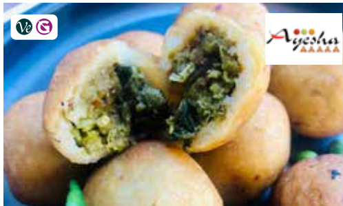
49792 Peas Dumpling 50x40gm

Fresh onions, potatoes, carrots and spinach mixed with spices and coated in a mildly spiced turmeric batter and then deep fried.