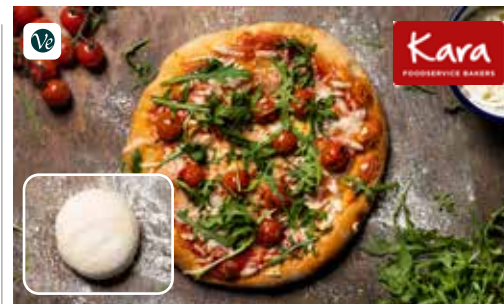
31920 Sourdough Dough Balls 60

Fully baked, pre-sliced, 19cm hotdog roll. A German baked speciality with a typical pretzel taste and a brown crust alternated by pale incisions.