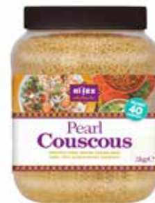
93010 Pearl Cous Cous 2kg

Giant Cous Cous, pre-toasted for a delicious nutty flavour. Quick cooking time and a very versatile option. Serve hot with pesto or fresh herbs and olive oil or cold in salads.