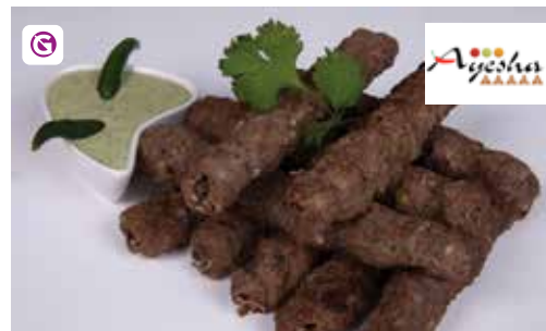
64582 Lamb Sheekh Kebab 25x70gm

Special spices with spicy fresh vegetables in a crispy pastry.