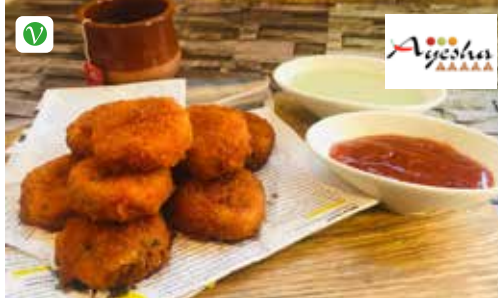
90404 Indian Cheese Cutlet 50x40gm

20 of each; alsoo tikki, onion bhaji, vegetable samosa and vegetable & spinach pakora. All handmade with quality ingredients & pre-fried.