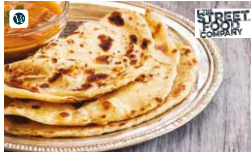
27157 Roti Paratha 20

An Asian street-food staple, these are steamed and folded.