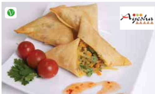
83770 Vegetable Samosa 50x40gm

Minced chicken mixed with peri peri sauce and potatoes in a thick, crusty handmade pastry.