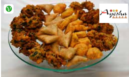
48007 Deluxe Vegetarian Selection 80x20gm

20 of each; alsoo tikki, onion bhaji, vegetable samosa and vegetable & spinach pakora. All handmade with quality ingredients & pre-fried.