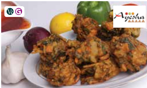
77833 Vegetable & Spinach Pakora 50x30gm

Fresh onion chunks in a mildly spiced turmeric coloured batter and then deep fried.