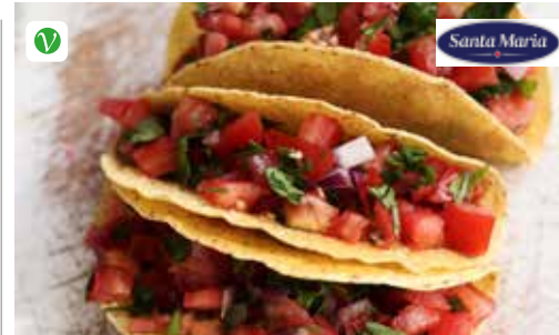
31700 Taco Shells 6x12

Buttery layered roti flat breads. 8 inch round.