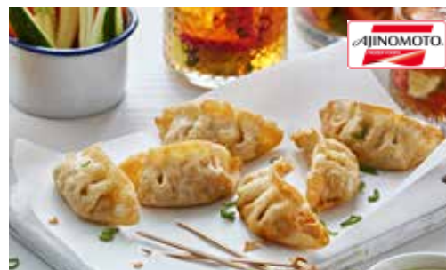
95359 Duck Gyoza 30x20gm

Half-moon shaped Japanese-style dumplings with a chicken, vegetable and soy sauce filling.