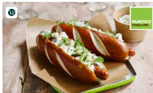
93405 Pretzel Hotdog-(80gm) 60

Fully baked, pre-sliced round wheat bun. A German baked speciality with a typical pretzel taste.