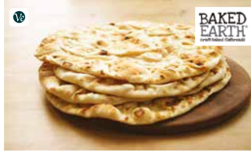
92916 Oval Sourdough Wrap 24

A ready-baked, large oval-shaped plain flatbread. Ideal for sharing or use as the base for a "posh" pizza. Approx 163gm each.