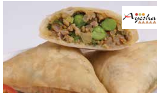
16686 Meat Samosa 50x38gm

Potato coated deep fried round balls stuffed with sweet and chilli flavoured peas with a hint of coconut.