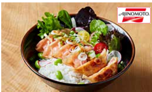
57964 Prawn Gyoza 30x20gm

Half-moon shaped Japanese-style dumplings with a duck, vegetable and hoisin sauce filling.