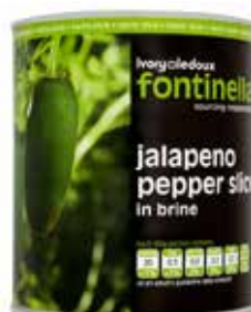
14508 Sliced Green Jalapenos 2.98kg

Sliced jalapeno chillies in a tin for nachos, pizzas, fajitas. Add to casseroles and chilli for a distinctive flavour.