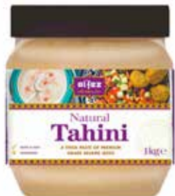
58371 Premium Natural Tahini 1kg

Best quality sesame seed paste. Traditionally mixed with Hummous but ideal as an accompaniment. Drizzle over salad or use in hot or cold wraps and pittas.