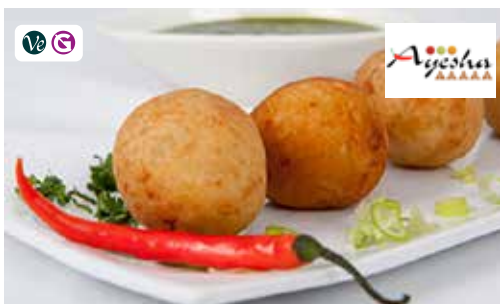
63306 Potato Dumplings 50x37gm

Minced lamb marinated in chillies, onions and special spices. A Halal accredited product.