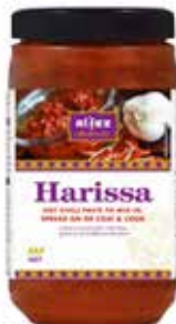
24813 Moroccan Harissa Paste 500gm

A smooth hot paste of chillies, tomatoes & garlic. Use in soups, sauces & stews, wherever an extra hot kick is required. Blend with mayo or yoghurt as a dip.