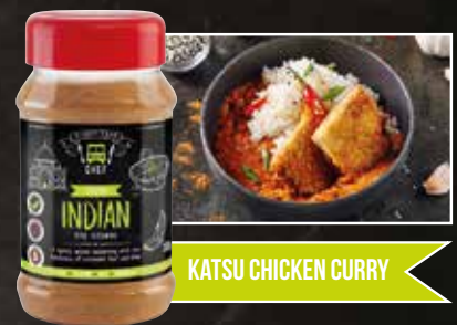
KATSU CHICKEN CURRY