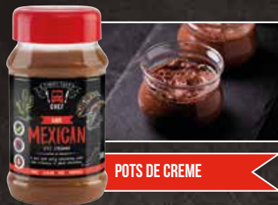
POTS DE CREME