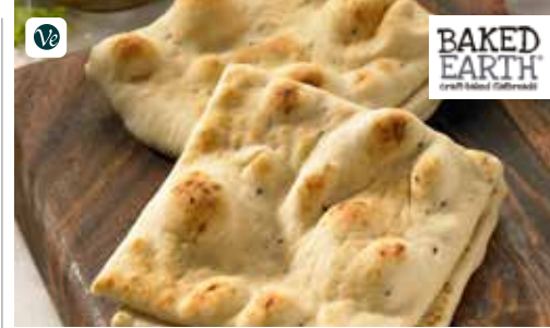
75521 Rectangular Folded Flatbread 32

A soft, flexible, oval-shaped wrap, made with a unique sourdough recipe to create a characteristically bubbly surface. Approx. 25 x 22cm.