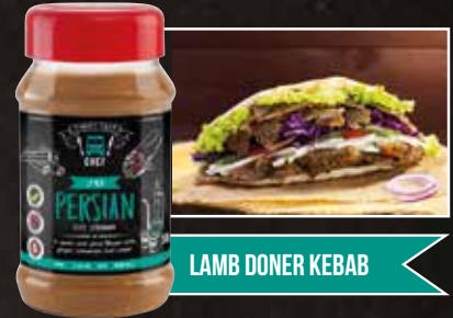
LAMB DONER KEBAB