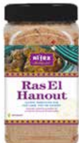
34727 Ras El Hanout Spice Mix 300gm

A complex aromatic blend of 15 herbs and spices with a heady lavender & rose petal finish. Use for as a rub, or as an ingredient in soups, tagines and meatballs.