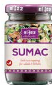
90434 Sumac Spice 6x38gm

A deep red berry granule imparting a vivid orange colour and a sharp, tangy, citrus flavour. Sprinkle on salads, rice, kebabs, hot & cold sandwiches to add some zest.