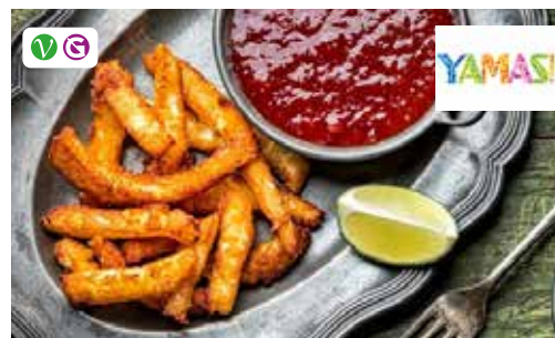
82151 Halloumi Fries 1kg

Japanese-style spinach flavoured dumplings filled with; cabbage, peas, edamame beans, carrots, white radish and soy sauce.