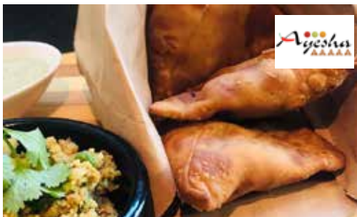
70653 Peri Peri Chicken Samosa 25x75gm

Minced lamb, fresh vegetables and special spices in a crispy pastry. A halal accredited product.