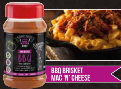
BBQ BRISKET MAC 'N' CHEESE

* These products do not contain declarable allergens under the EU regulation 1169/2011 (annex II).