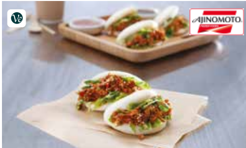
70497 Hirata Buns 2x30

Ready-baked and folded rectangular naan flatbread with kalonji seeds (black onion) for flavour and added visual appearance.