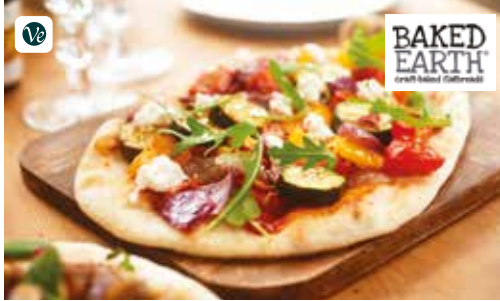
90716 Large Oval Flatbread 24

A ready-baked, large oval-shaped plain flatbread. Ideal for sharing or use as the base for a "posh" pizza. Approx 163gm each.