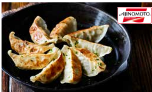
17571 Chicken Gyoza 30x20gm

Sweet, chilli flavoured potato dumplings with a special mixture of spices then deep fried in a thick batter. Uses vegetable ghee.