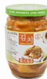
71736 Kimchi 369gm

Chinese cabbage with radish, garlic, ginger, onion and red pepper powder. A classic Korean side dish.