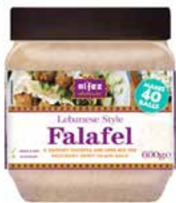
55281 Middle Eastern Falafel Mix 600gm

Authentic blend of ground chickpeas, herbs & spices. Just mix with water and shape into shapes you require and deep or shallow fry.