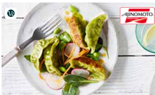
69338 Vegetable Gyoza 30x20gm

Japanese-style prawn dumpling with beetroot powder coloured pastry.