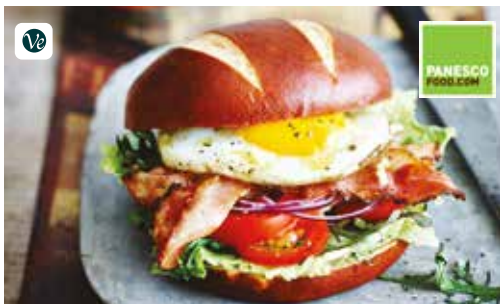
75100 Pretzel Bun-(80gm) 42

Crispy, fried corn shells, which can be filled with vegetables, taco sauce, meat or prawns.