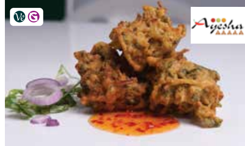
71347 Onion Bhaji 50x30gm

Mildly spiced paneer and potatoes with a hint of lemon, coated in breadcrumbs then deep fried. An Indian snack also known as Paneer Tikki.