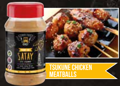
TSUKUNE CHICKEN MEATBALLS