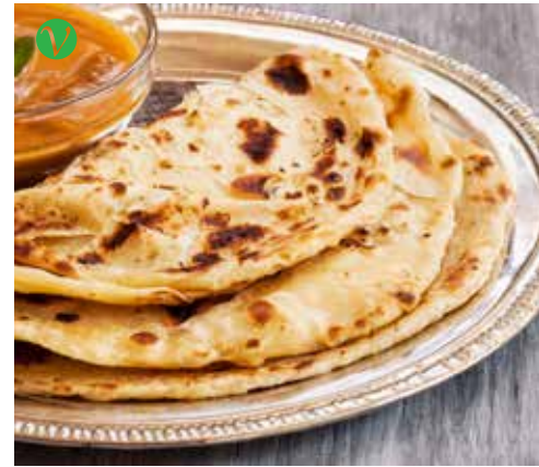
RHOTI PARATHA 27157 Buttery layered roti flat breads. 8 inch round