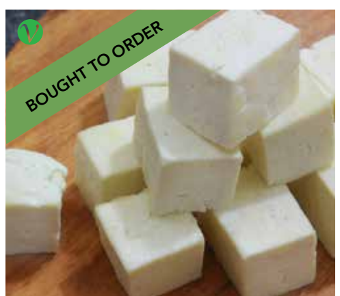
PANEER CHEESE (APPROX 1KG) 20608

DELUXE VEGETARIAN SELECTION 27736 80x20gm Aloo tikki, onion bhaji, vegetable samosa and vegetable & spinach pakora. All handmade with quality ingredients and pan fried.