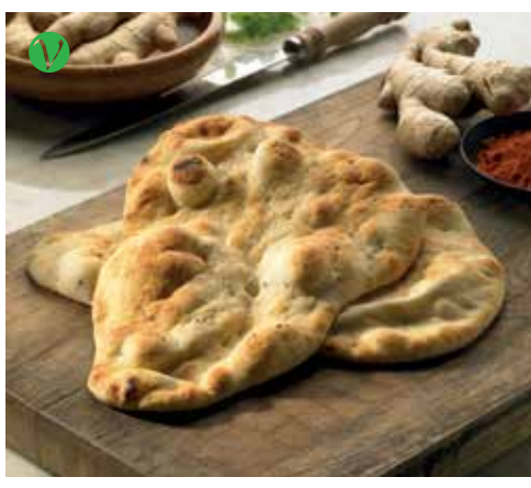
LARGE TEARDROP NAAN BREAD 24x130gm 37163