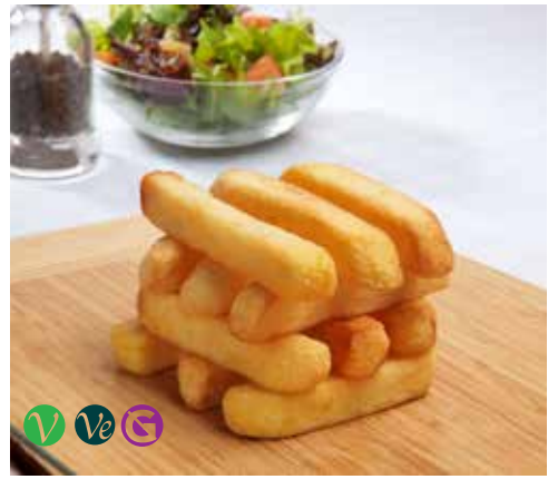
FREEZE CHILL CHUNKY CHIPS 63108 4x2.5kg